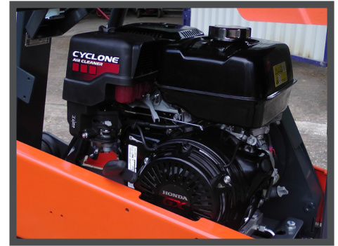
NEW HONDA GX390 (CYCLONE) PETROL ENGINE AVAILABLE