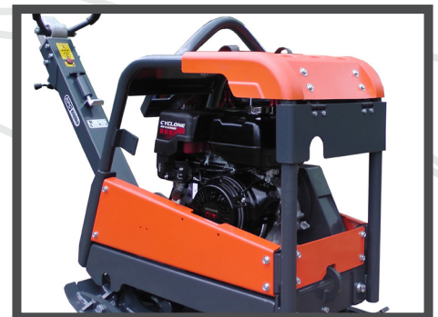
ROBUST FRAME FOR TOUGH SITE CONDITIONS & BUILT-IN LIFTING POINTS